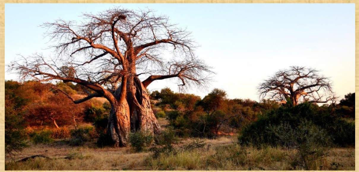
The Baobabs on the way to Reedbuck Vlei.

Leaving the Fever Tree Forest, we entered into a corridor of Baobab Trees, the icons of the Lowveld, now devoid of their summer canopies, their root-like branches reaching high into the air giving substance to the Bushman belief that they did indeed fall from the sky in an upside-down position!!