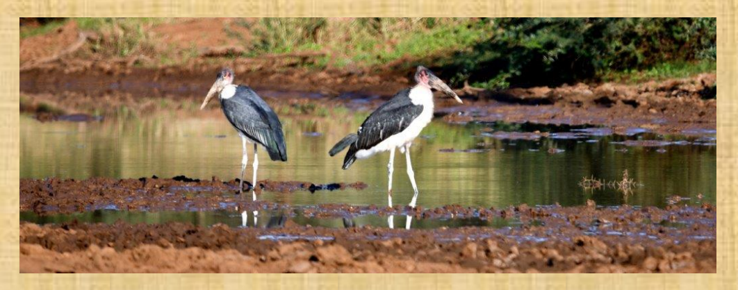
The Two Maribou Storks patrolling the shallows of the drying drainage line.

Unfortunately, no Hyenas were seen but two Black Backed Jackals were dozing lazily in the shade while many Vultures were still scavenging on the ground. No Lappett Faced Vultures were initially seen but as we backtracked to Rhino Boma Road, two Lappetts came into view in the Apple Leaf trees to our left along with a juvenile Bateleur Eagle.