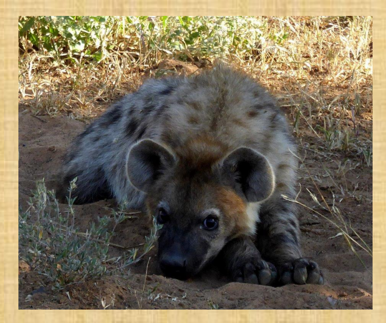
The young Hyena at the roadside.

We were then treated to a young Spotted Hyena lying down right next to the road, appearing very comfortable with our close proximity.