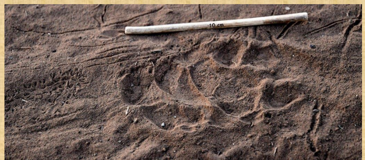
The Porcupine Tracks showing the partial register of the back foot onto the front, multiple back pads while note the quill marks left in the sand just below the left end of the marker stick.

With a Leopard being heard calling around camp during the night in addition to a nocturnal visit by a Buffalo Bull along with the requisite patty deposit, we drove out of camp with the sun still in its infancy, intending to head to the Fever Tree Graveyard near Crooks' Corner. We were delayed somewhat, however, by the quality of tracks we found on the road outside camp with two sets of Leopard tracks, Genet, Ground Beetles and tracks of three Porcupines, their multiple pads and quill drag marks showing up clearly in the soft substrate.