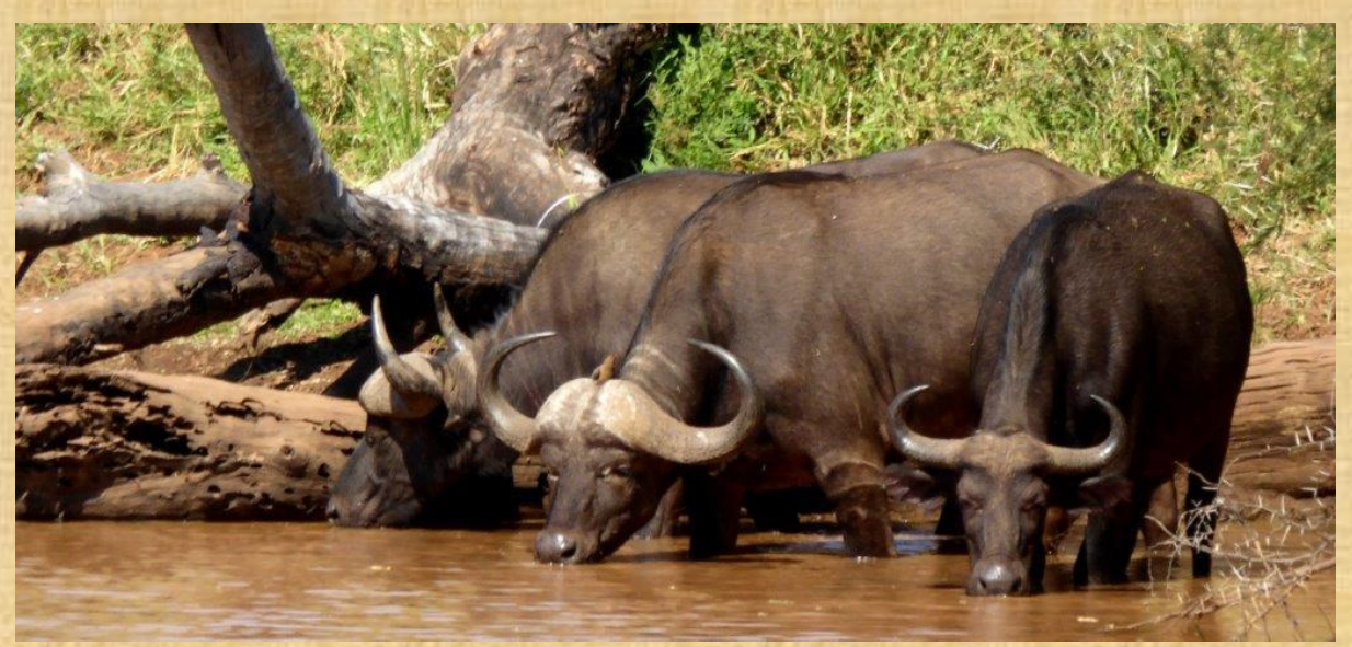
Part of the Buffalo Herd at Nwambe Pan.

With Open Bill Storks patrolling the banks of the pan, seemingly oblivious to the threat of the very large patrolling Crocodiles, Buffalo appeared on the opposite bank making their way down to drink.