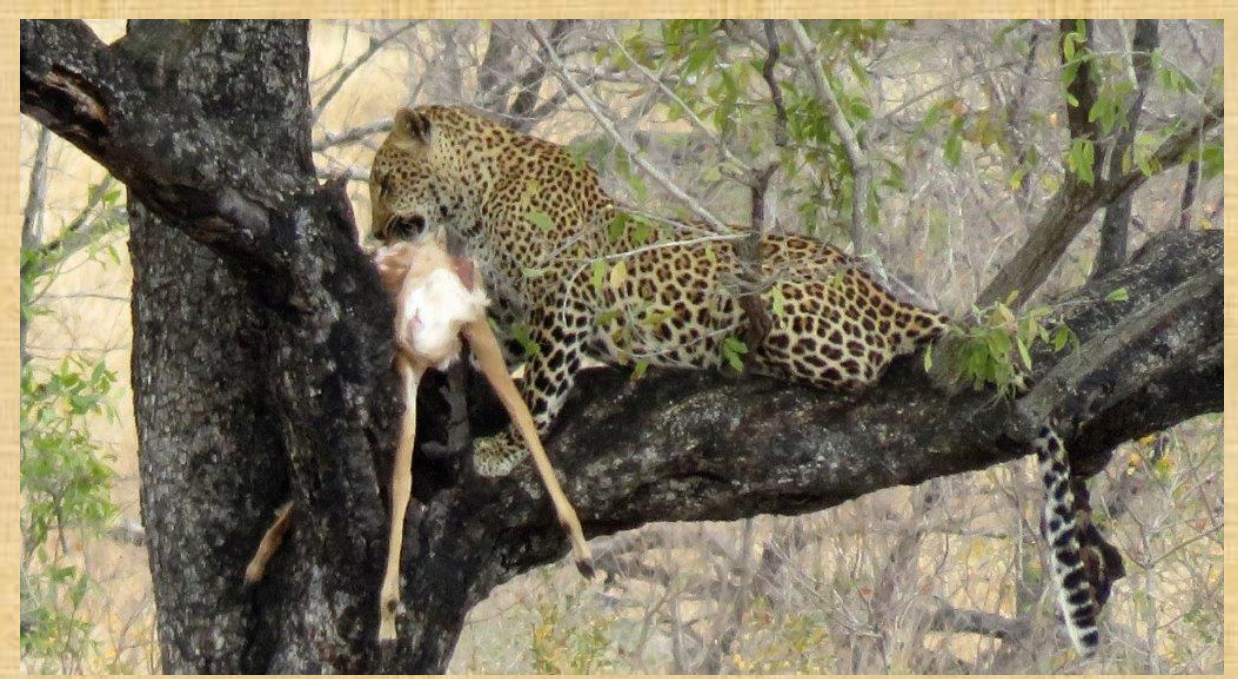
Leopard Kill, Berg-en-Dal, Kruger National Park, August 2018

2018 also saw Shangani Trails conduct three very successful, privately driven safaris in the southern regions of Kruger National Park, principally in the Lower Sabie and Berg-en-Dal areas. Accommodation is either in the Kruger National Park Rest Camps or a very comfortable resort at Crocodile Bridge just outside the Park. These trips will only be conducted outside the School or Public Holiday periods.