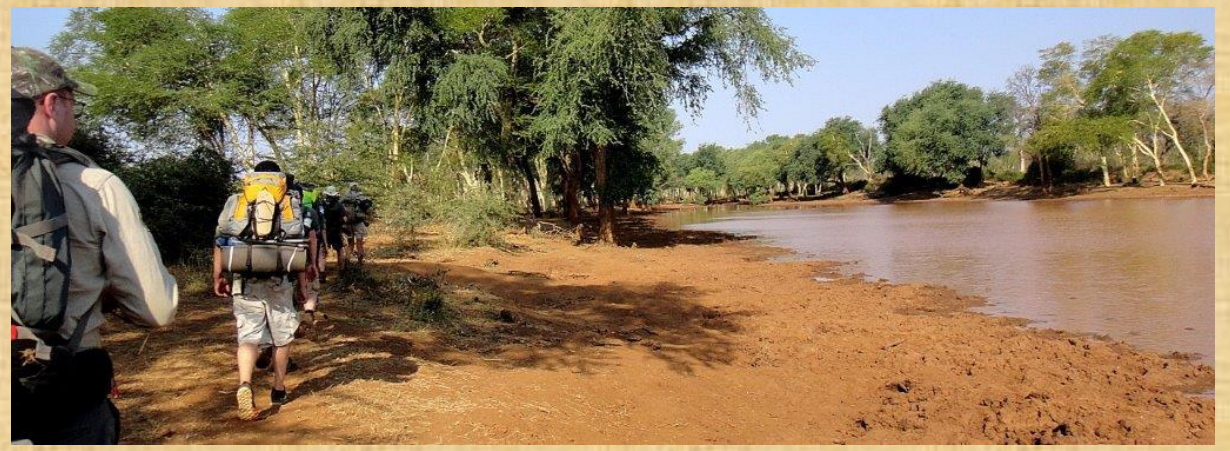
A Wilderness Trail skirts Nwambe Pan.

The Wilderness Back-Packing Trails offer between 3-5 nights sleeping under the stars, carrying your world on your back for the duration. You will not get closer to Mother Nature than this, experiencing amazing topography and wildlife while immersing yourself in the spirituality of the African Bush.